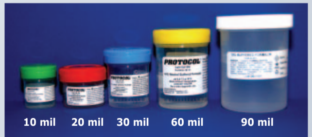
10% Formalin Pre-filled Tissue Biopsy Containers