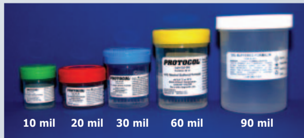
10% Formalin Pre-filled Tissue Biopsy Containers