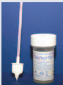
Thin Prep Pap Test Vial with Broom