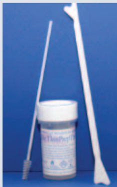
Thin Prep Pap Test Vial with Brush and Spatula