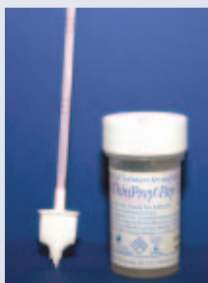
Thin Prep Pap Test Vial with Broom