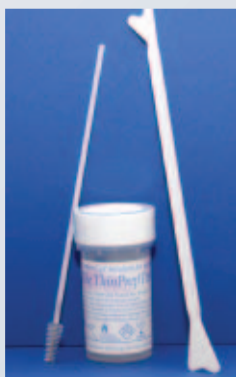
Thin Prep Pap Test Vial with Brush and Spatula